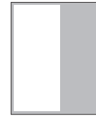
1/2 Page 7" x 4-13/16"